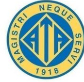
EXHIBIT APPLICATION FORM for 2019 (Please complete each form area)

March 7, & 8, 2019 SHAW CONFERENCE CENTRE